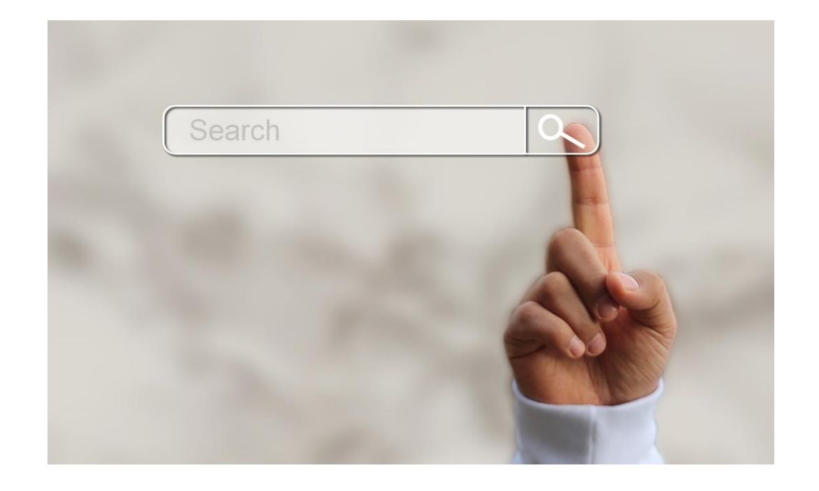
Try a search engine!