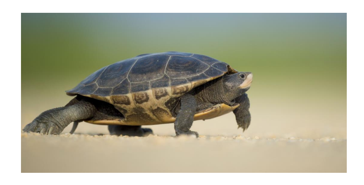
Take a break!